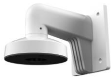
DS-1272ZJ-110-TRS Wall Mount