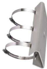
DS-1275ZJ-SUS Vertical Pole Mount