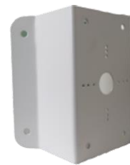
DS-1276ZJ-SUS Corner Mount