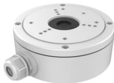
DS-1280ZJ-S Junction Box